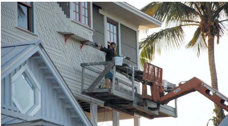
Figure 5. An all-terrain forklift with a workbasket holds tools and siding and provides a safe elevated platform (top and above). When the forklift can't get access, the author uses pipe staging (right).