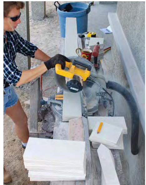
Figure 2. A short length of vacuum hose attached to the dust port helps direct fiber-cement dust downward, away from the operator.

Even using depth adjustment, I have to turn the air pressure down to avoid overdriven nails. I usually start at around 80 to 85 psi, then vary the pressure