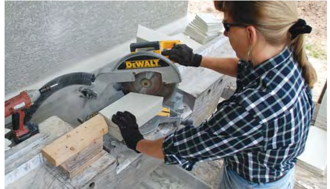
Figure 8. After the blanks are cut to length, shingles are given diamond points and diagonal cuts on the miter saw (left). A simple jig screwed to the saw stand holds a stack of shingles perpendicular to the fence when the angle exceeds the saw's capacity (above).

shingles in more moderate climates, two-layer coursing should be adequate. With two-layer coursing, shingle length should be twice the exposure plus 2 inches.