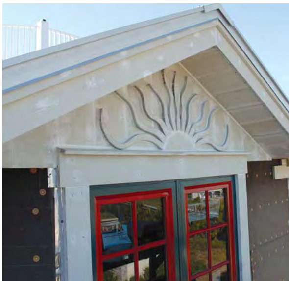
Figure 3. Fiber cement can also be used to make decorative gable treatments. Scroll cuts are made with an orbital jigsaw fitted with a carbide-grit blade.