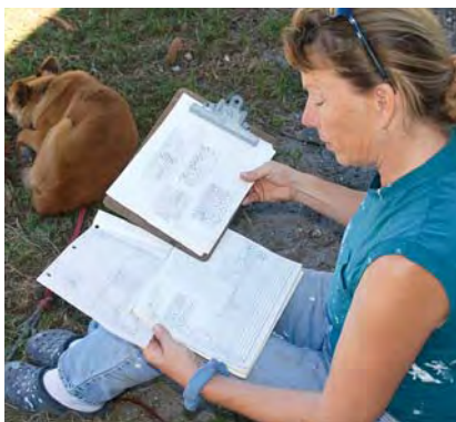
Figure 1. Taking a cue from the decorative shingling on Victorian homes, the author integrates fancy-cut shingles made from fiber cement into many of his projects (top left and top right). After designs are sketched on graph paper, shingles are made on site from lengths of lap siding (above and right).