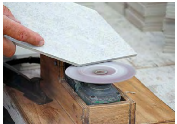
Figure 9. Single edges are eased with a small angle grinder equipped with an 80-grit disc. The tool is enclosed in a plywood box; a large nail holds down the paddle switch.