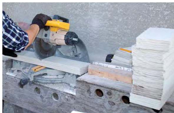
Figure 7. The author's saw stand is sturdy enough to support up to five 12-foot lengths of lap siding — a good 75 pounds of material (above). Stops made from wood scraps can be quickly screwed to the top for repetitive cuts (left).