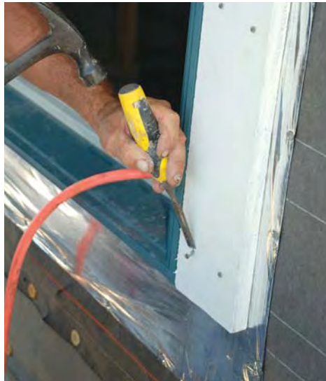
Figure 4. Pulling ring-shank siding nails with a claw hammer or flat bar can crush fiber cement. Instead, the author nicks bent nails with a “beater” chisel, then bends them back and forth until they break. Remnants are hammered below the surface, and the hole is filled with latex caulk.

depending on the type and thickness of the sheathing and how many layers of siding I'm nailing through.